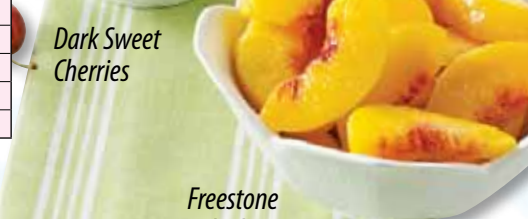
Freestone Peach Slices