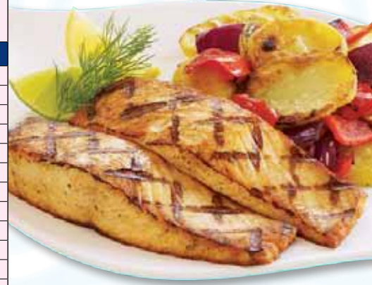
"Jail Island" ™ Salmon served with Calabrian Potato Blend