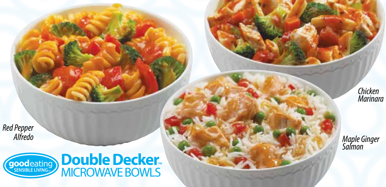
Red Pepper Alfredo