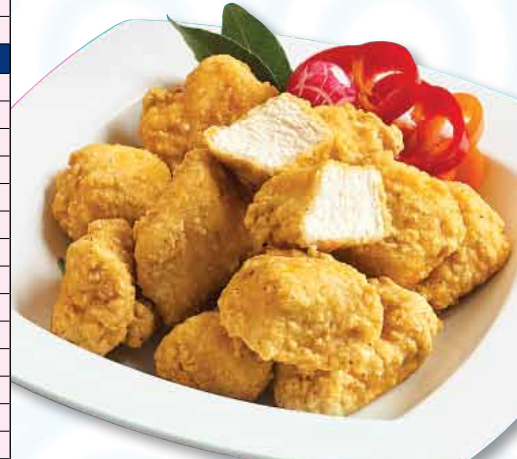
Original Boneless Chicken Chunks