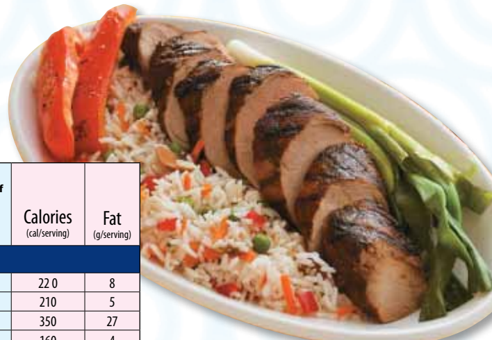
Teriyaki Pork Tenderloin served with Rice & Vegetable Medley